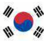
South Korean Language